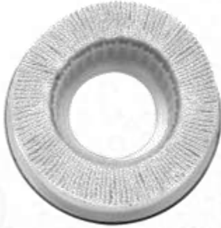
Pleated Filter Sectional